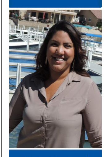
Administration & Lake Management

We are excited to be completed with our aerators and are excited to put them to use. We still have 3 pending more material but the other 14 are ready to be put into service.